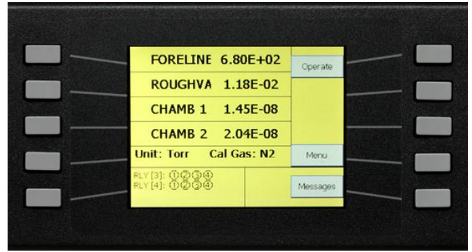
Four gauge display