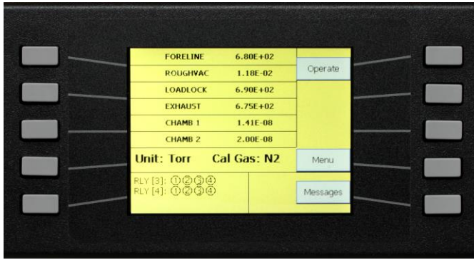
Six gauge display