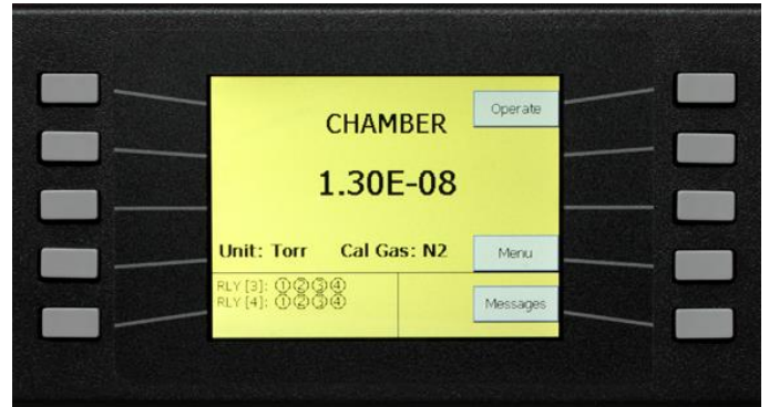
One gauge display - auto scroll one gauge at a time