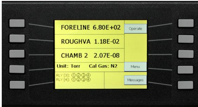
Three gauge display